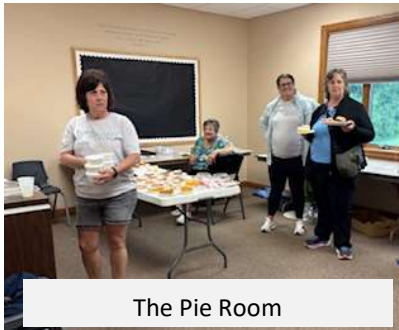
The Pie Room