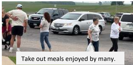
Take out meals enjoyed by many.