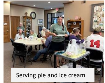
Serving pie and ice cream