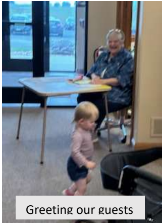
Greeting our guests